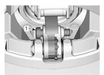
1. Pivot Bolt